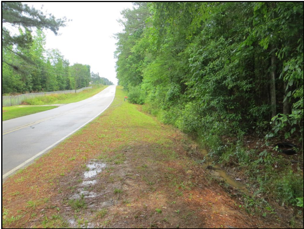
Frontage along Kelley Rd(Pike County Rd #1128)