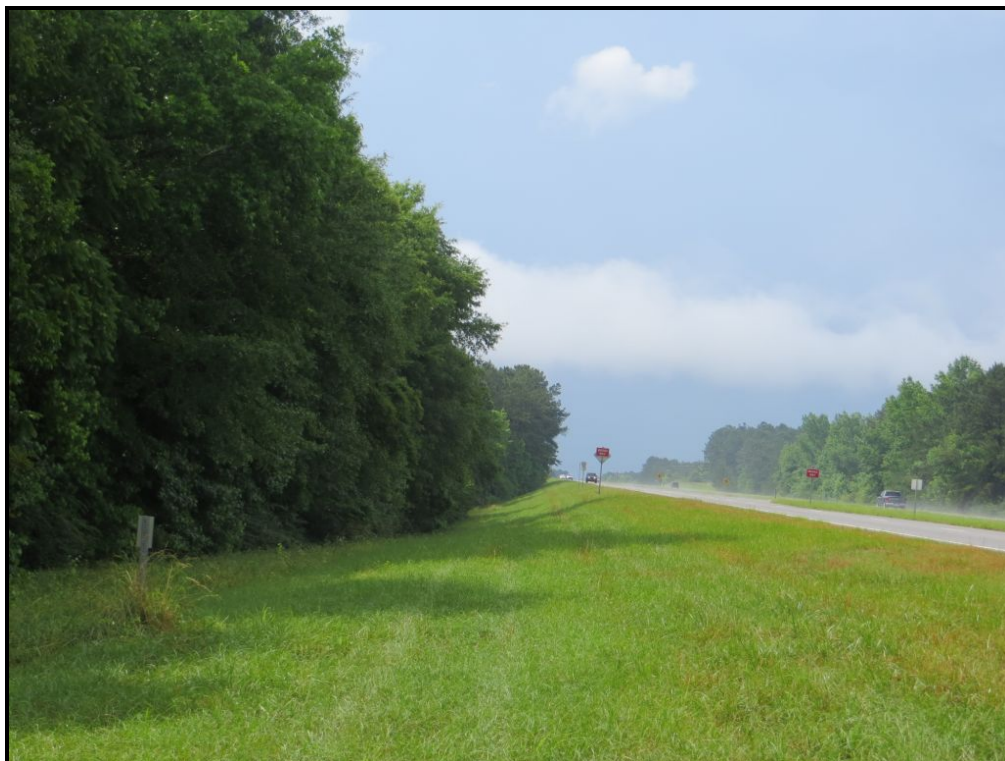
Frontage along Hwy. 231